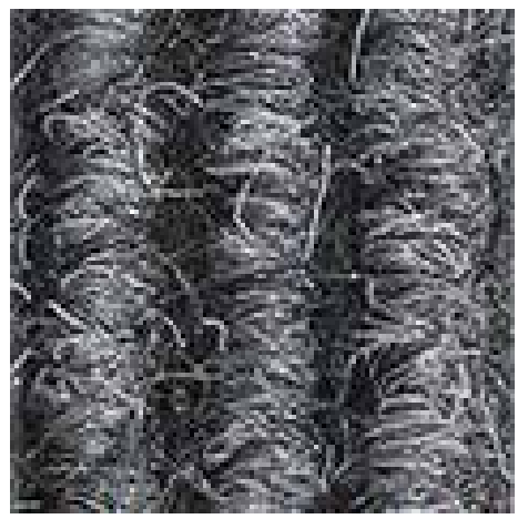
Light grey no. 220