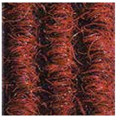
Red no. 305