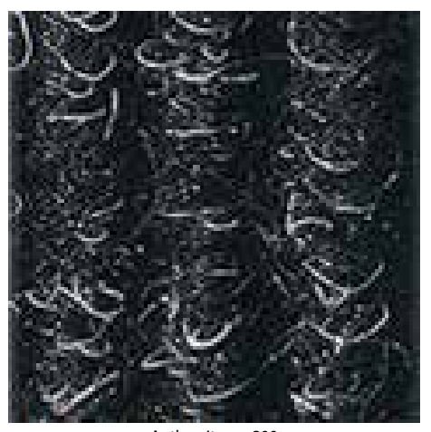
Anthracite no. 200