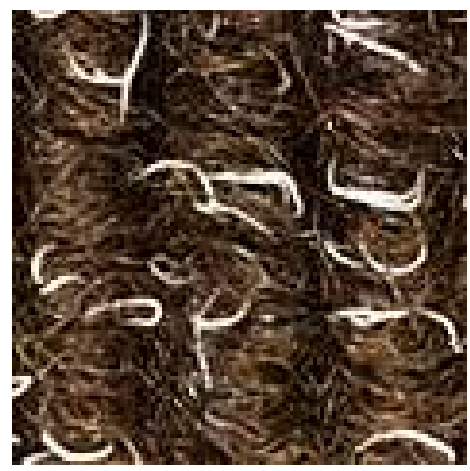
Brown no. 485