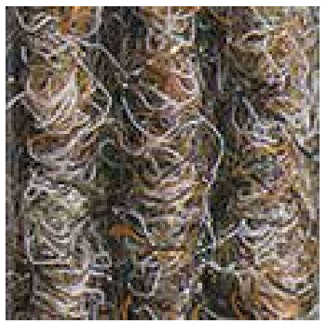
Sand no. 430