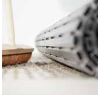
This is how the mats are cleaned: With light soiling, the mat can be cleaned using a vacuum cleaner with high suction power (depending on usage). With moderate soiling, also sweep the mat and the mat well with a broom after rolling up the mat. With heavy soiling, wash the mat with a high-pressure cleaner and prop it up to dry.

Cleaning time and costs are reduced by up to 90%.