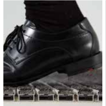
How the mats retain their functionality over the long term: The dirt does not stick, but falls into the gaps between the mat profiles. Moisture is absorbed, but it is also given off again. Since the mats can be rolled up, the dirt can easily be brushed out of the matwell, preventing it from being picked up again by subsequent visitors.